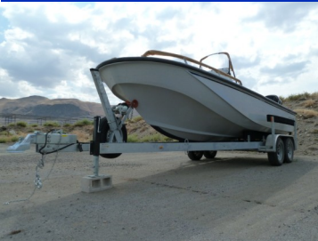
22 foot Boston Whaler

PLF has purchased a brand new 22-foot Boston Whaler! Known as the Un-sinkable Legend, it is made to remain afloat even when completely swamped with water. With the unpredictable waters of Pyramid this boat is a necessity.