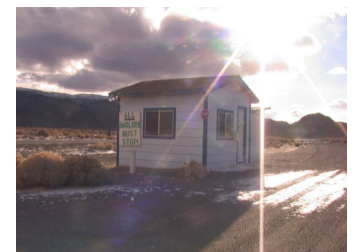
Stop by for a chance to win $50!!!

The drawing will be done on a monthly basis, with one person randomly chosen for the $50 prize. The station will be open every weekend once fishing season opens, from 10:00 am to 6:00 pm, so stop by and enter.