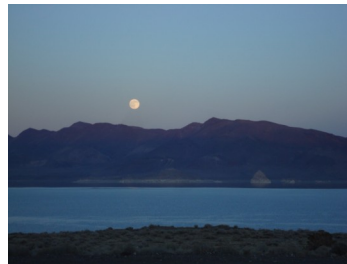
Full moon at dusk over Pyramid Lake

Please send us your photos with your big fish so we can include them in our next issue. We look forward to seeing you soon and hope your fishing experience here at Pyramid Lake is a good one.